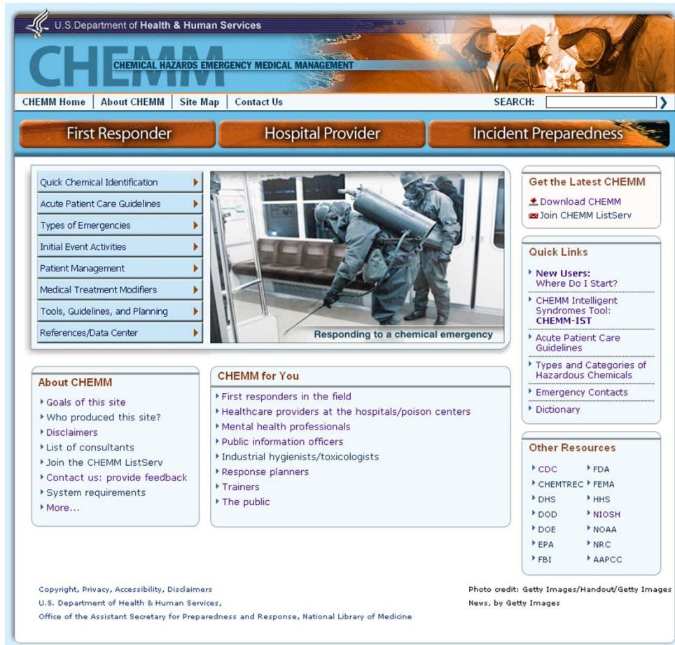
Legend: FIGURE 1: Home page of CHEMM